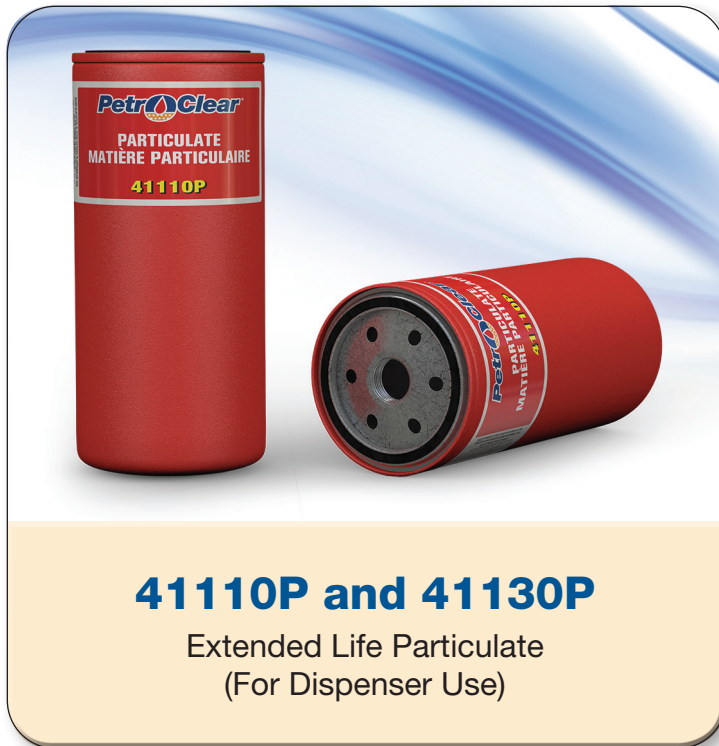
41110P and 41130P Extended Life Particulate (For Dispenser Use)

FOR DISPOSAL INFORMATION PLEASE CONTACT YOUR NEAREST EPA OFFICE.