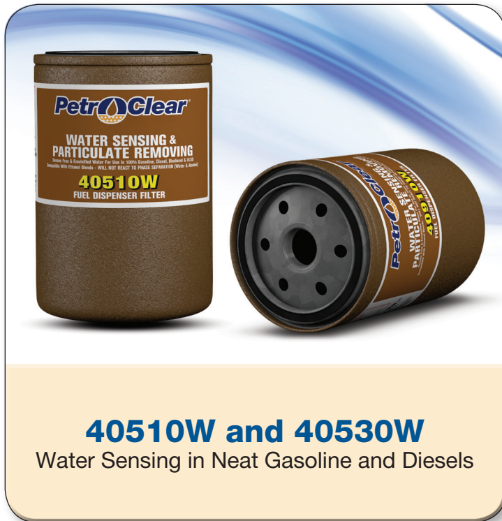
40510W and 40530W Water Sensing in Neat Gasoline and Diesels

FOR DISPOSAL INFORMATION PLEASE CONTACT YOUR NEAREST EPA OFFICE.